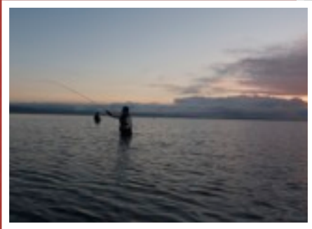
Awahou Stream mouth